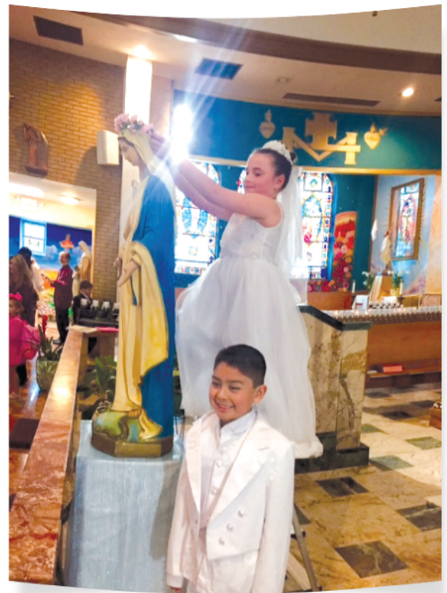
Crowning Mary on First Holy Communion Day at Our Lady of Guadalupe Parish Shrine, Lindenwold.

We enroll 385 students in grades Preschool through Eighth Grade. Over 70 new students join us this fall at all grade levels. We are proud of the accomplishments of our students. Our students learn the value of Christian