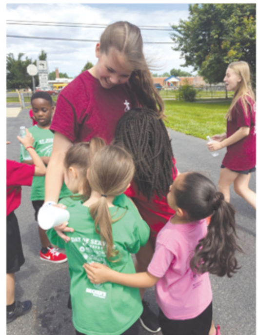
Our Prayer Buddy program is mutually beneficial for both older and younger students. Middle School students enjoy spending time with Preschool and Kindergarten students during the school year to attend mass together and share fun activities together.