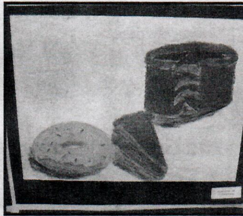
4th Grade Artwork- Wayne Thiebaud Oil Pastel Cakes