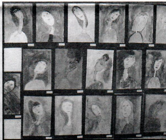
5th Grade Artwork-Amedeo Modigliani Self Portrait